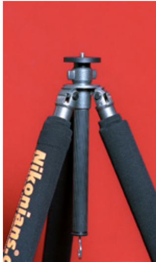
1. Remove ballhead