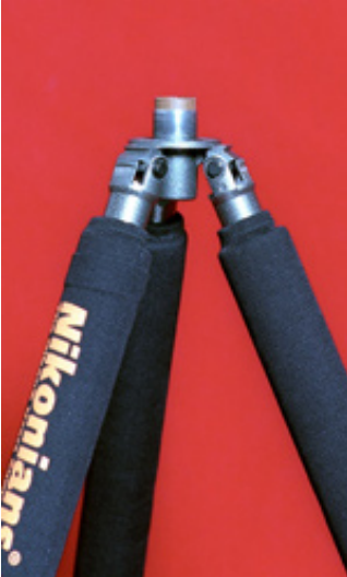
3. Remove column fastener