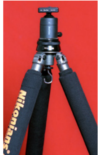
8. Mount Q-Ball head