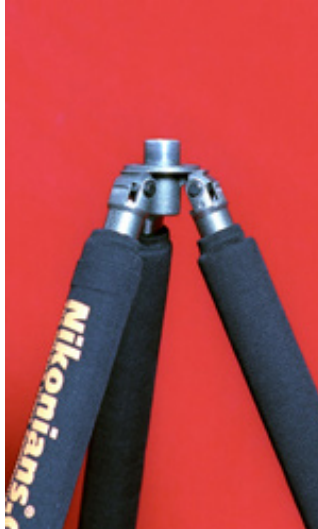
4. Remove column liner