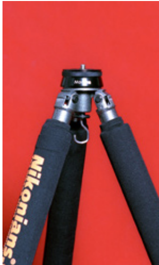
7. Insert TB tube, attach hook