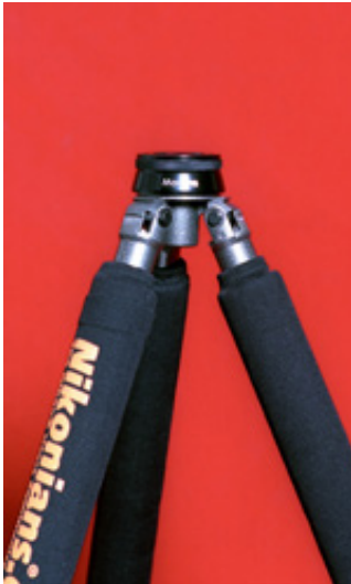
6. Fasten TB plate