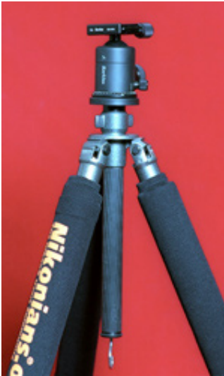
Gitzo with Markins Q-Ball